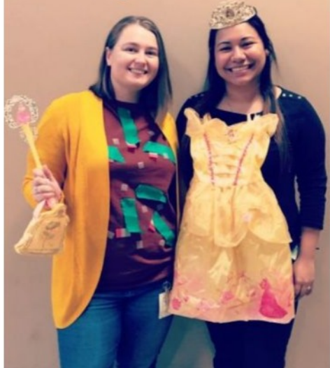
Most Original: Taco Belle