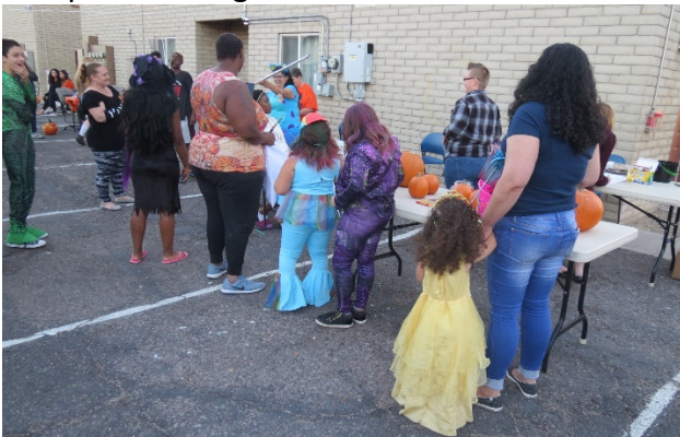
Everyone enjoying themselves