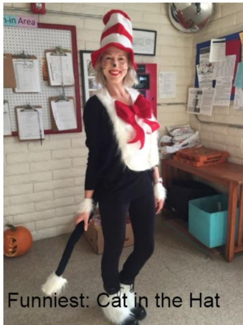
Funniest: Cat in the Hat