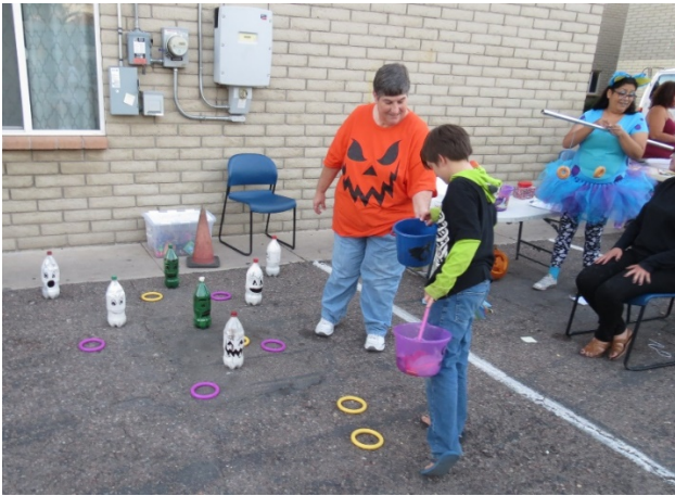
Ghost ring toss