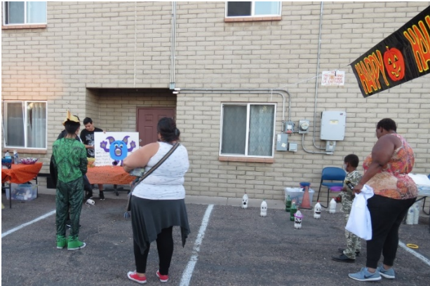
Monster bean bag toss